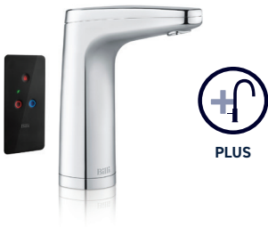
XR Remote Dispenser